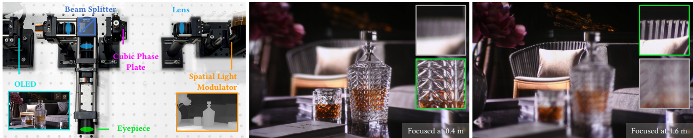
Figure 1: Left : Our display prototype. Middle and Right : Captured images from our prototype using a Nikon Z5 with a near (mid) and far (right) camera focus, at F/5.6 , 100 ISO, and 1.3 sec exposure. (Scene courtesy of “Entity Designer” at Blender Market)